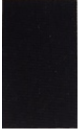
Black (White Print)