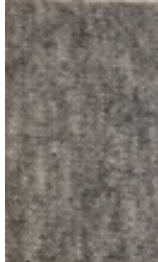
Gray (Black Print)