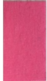
Neon Pink (White Print)