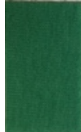
Kelly Grn (White Print)