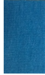
Neon Blue (White Print)